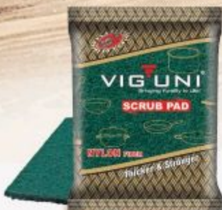
Scrub Pad ▲ Nylon Fiber Thicker Size : 3 X 4 Inch.