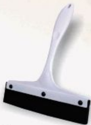
▲ Kitchen Wiper Blade Size : 8 Inch.