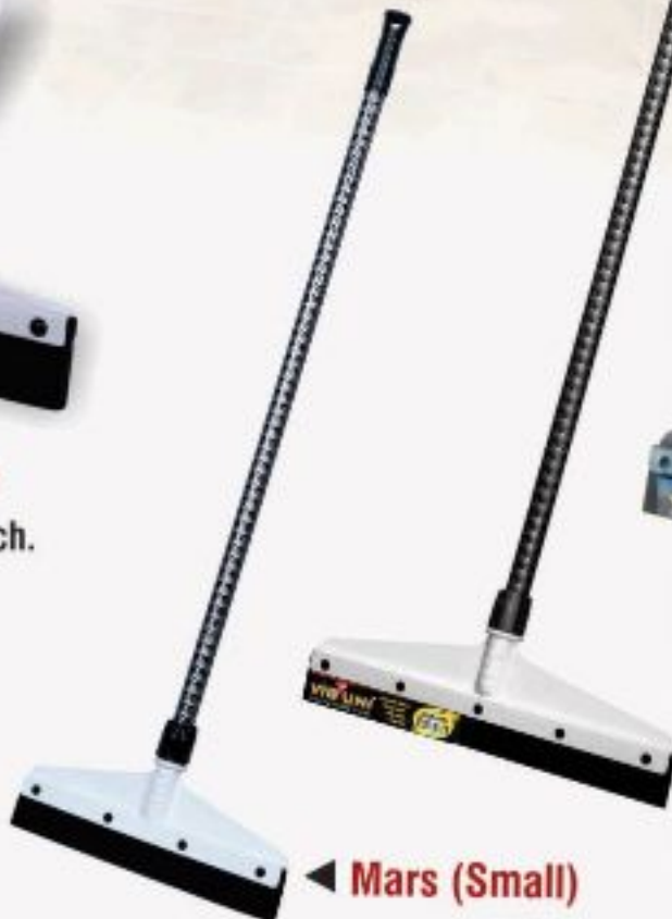
▲ Mars (Small) Blade Size : 12 Inch. Handle : 33 Inch. Pipe Dia : 7 Soot