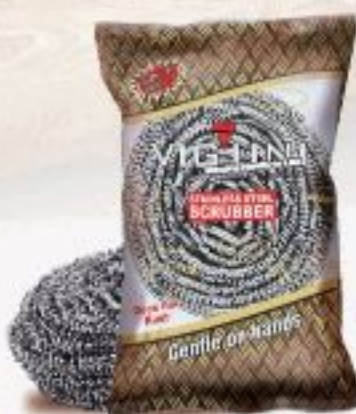
Stainless Steel Scrubber ▲ Non-Rust Stainless Steel Weight : 20 gms