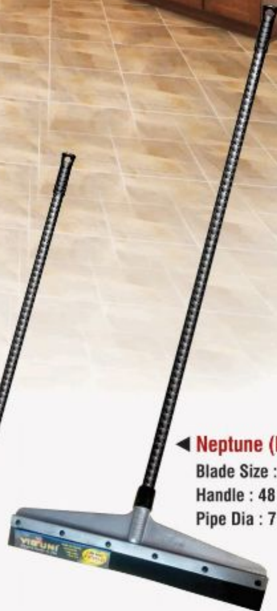
▲ Neptune (Big) Blade Size : 19 Inch. Handle : 48 Inch. Pipe Dia : 7 Soot