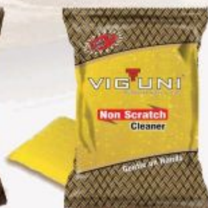
Non Scratch Dish Cloth ▲ Superior Cloth Heat Sealed HD Foam Size : 135 x 95mm