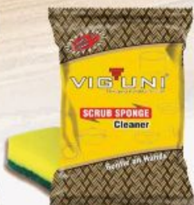
Scrub Sponge ▲ Nylon Pad HD Foam Size : 3 x 4 Inch.